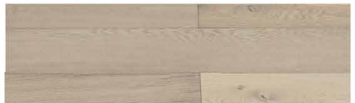
Au Naturele 0103