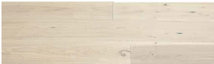
Winter Oak 0102