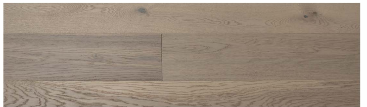
Log Haven 0201