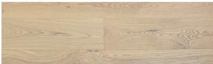
Amber Oak 0101