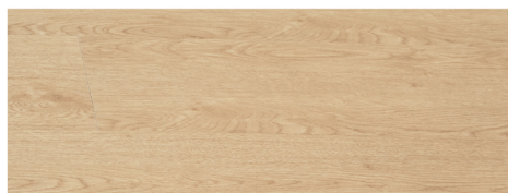
Palomino Prairie 0102