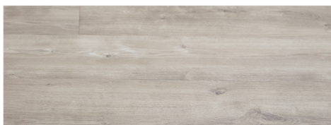
Mohegan Bluff 0101