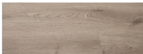
Arroyo Dune 0105