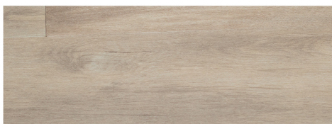
Chinook Avenue 0104