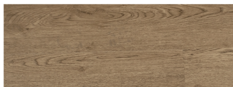
Ochre Point 0203