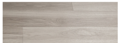
Doe Mountain 0103