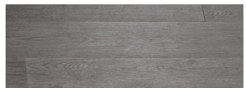
Stormy Port 0301